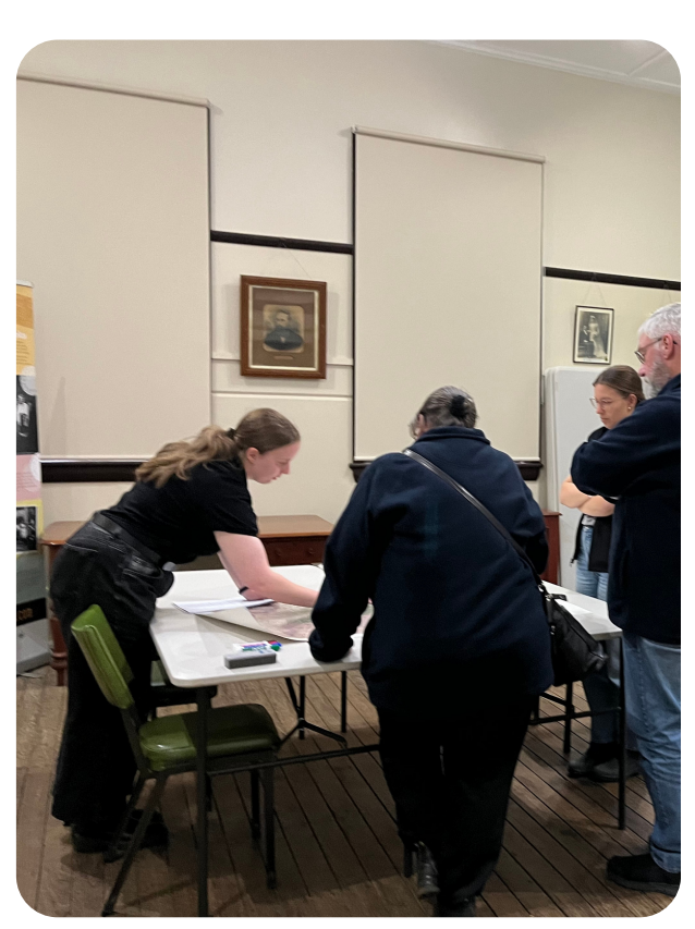
Community engagement in Spring Hill

As we continue to work through the prospect, we will continue to provide you with information on each of these key issues.