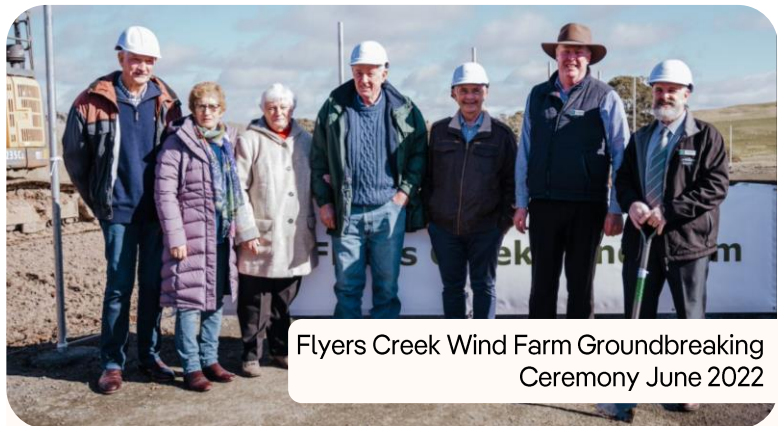
Flyers Creek Wind Farm Groundbreaking Ceremony June 2022

Iberdrola Australia is committed to working with local communities and stakeholders to ensure our projects have positive long-lasting impacts. We seek to act as a good neighbour, establish a long-term relationship, and become an integral member of the local communities within which we operate. We look for opportunities to share the benefits of our projects with the local community.